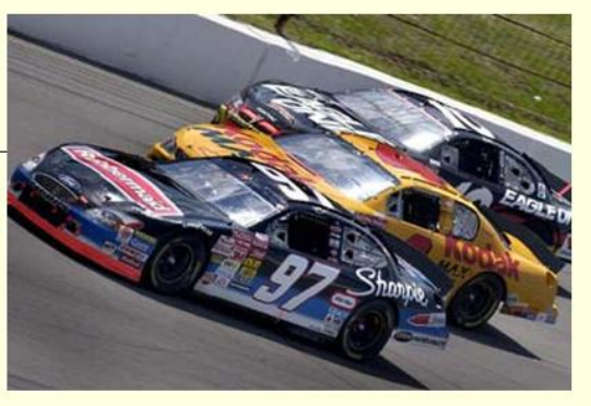
(1) complexity theory, since the racers selforganize into structures that oscillate between order and chaos; (2) social network analysis, since draft lines are line networks whose organization depends on a driver's social capital as well as his human capital; and (3) game theory, since racers face a "prisoner's dilemma" in seeking drafting partners who will not defect and leave them stranded. Perhaps draft lines and related "bump and run" tactics amount to a little-recognized dynamic of everyday life, including in structures evolving on the Internet. (social Science at 190 MPH)