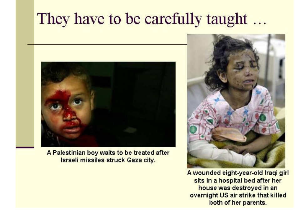
Figure 1. Young children depicting social and economic costs of war.

Components of a course in global economics might address the social and economic costs of war, slave labor, trafficking in women and children, and so on. The International Labor Organization (1997) reports that 250 million children around the world who should be in school are at work instead, many in conditions of slavery in mines, factories, and plantations. As demonstrated in Figure 1, issues regarding human rights and social justice may make a deeper and more resonant impression on the students if presented within the context of the impact on babies and young children, as in the illustrated case of the affects of warfare on children in Palestine and Iraq. Another application of this theme may be to consider the health services provided by nations in terms of infant mortality rates. Yet another economic concept may be illustrated through this applied theme: studies have found that the level of child spankings correlates to income levels, as higher income parents may be better placed to inflict financial rather than physical punishments.