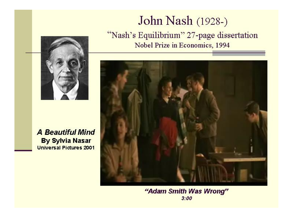
Figure 3. Film clip demonstrates John Nash's theory of equilibrium.

The economic cycle might be considered through a relationship perspective on analysis of the cyclically graphic sigmoid curve . It illustrates the story of economic cycles or a corporation's rise and fall. It may even chart the course of love and relationships. Relationships may start slowly, experimentally, and clumsily; reach romantic peaks, and then—without proper care and attention—the relationship cycle may terminally wane. Furthermore, employing the relationship theme to help demonstrate John Nash's theory of equilibrium, international students may benefit by a video clip from the popular movie A Beautiful Mind (Figure 3) calling into question a fundamental principle of Adam Smith that the driver of individual self-interest serves the common good. The clip portrays young men in a bar competing for the attentions of a young beautiful woman, ultimately tripping over each other as well as alienating the other young women in the room. The clip illustrates a proposed mixed of strategies, where the best interests of the individual are served when also considering the good of the group.